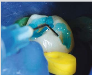
zmack ® etch