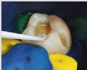
zmack ® bond