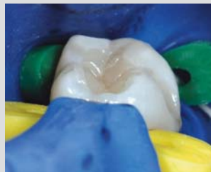
zmack ® comp